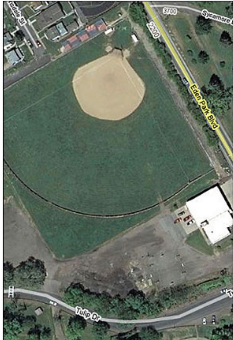
Helen Richey Field (Click for Google Maps view)

The city also would like to see Serra Catholic High School --- which presently uses a field in Elizabeth Township for home games* --- play at Helen Richey Field.