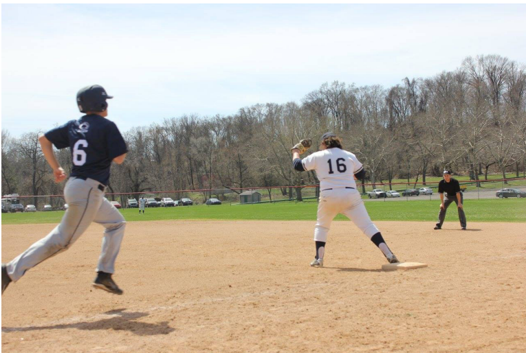
Renovated Helen Richey Field in McKeesport PA