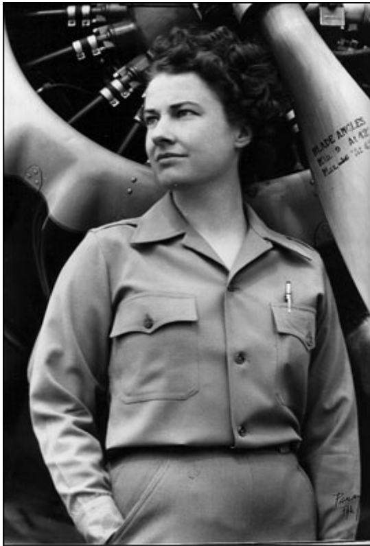
McKeesport Heritage Center is celebrating the life of Helen Richey, the world's first female commercial airline pilot, with a yearlong schedule of events. The Richey celebrations will conclude with a dinner in November 2009 during the centennial of her birth in the city.